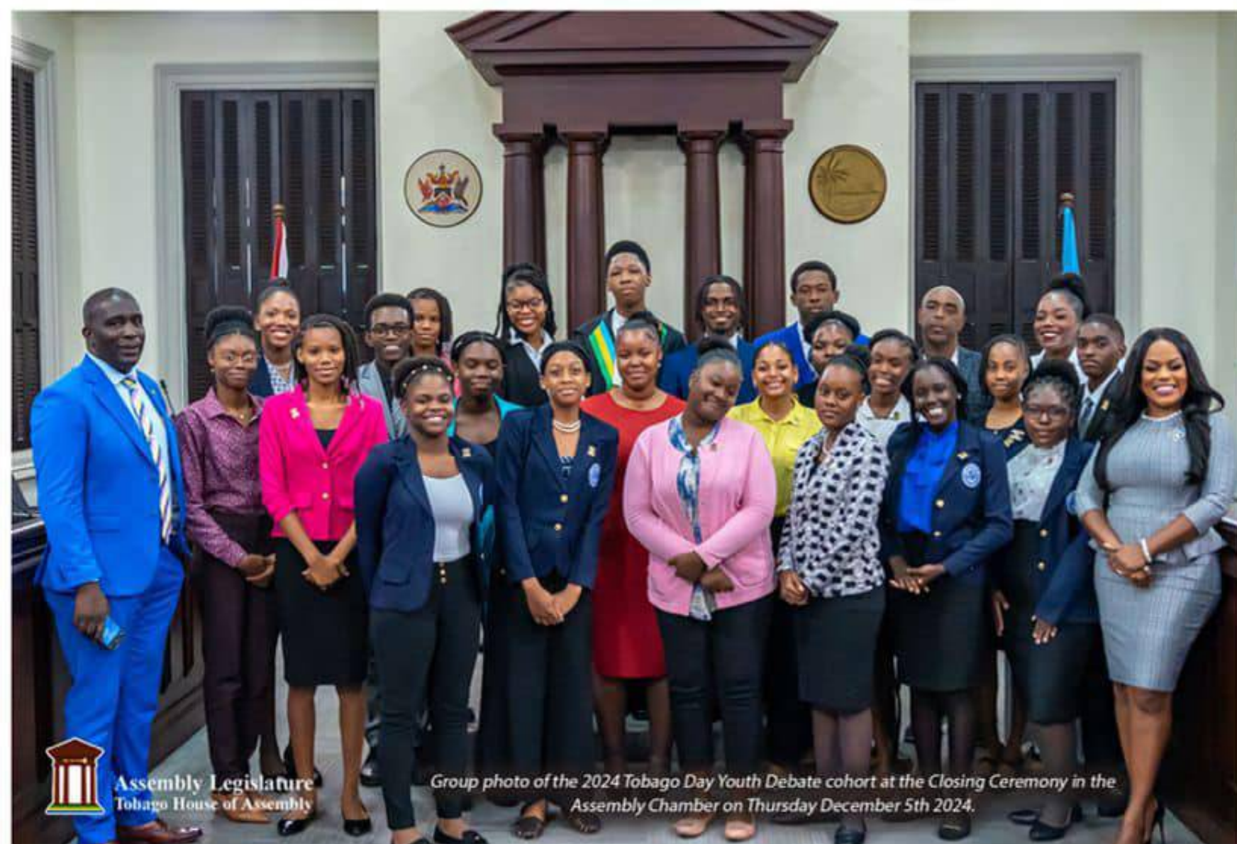
Group photo of the 2024 Tobago Day Youth Debate cohort at the Closing Ceremony in the Assembly Chamber on Thursday December 5th 2024.